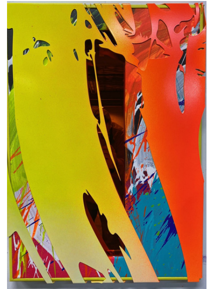
Marton Nemes, Meta painting 20, 70 x 50 x 4 cm, 2022